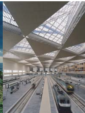
Zaragoza High-Speed train station