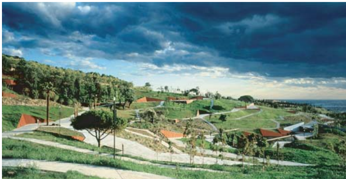
Barcelona Botanical Garden